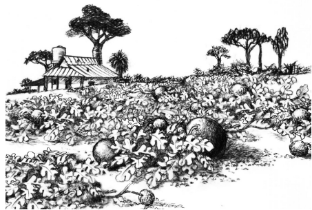
It is God that makes the plants grow