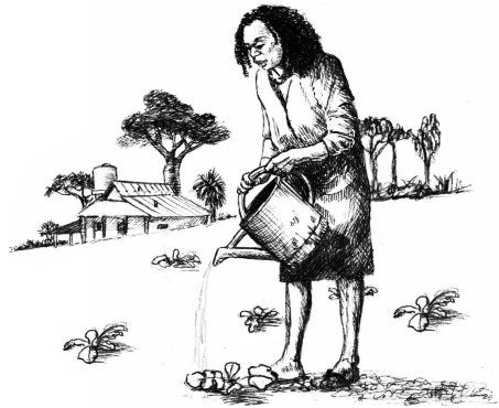
Another worker waters the plants