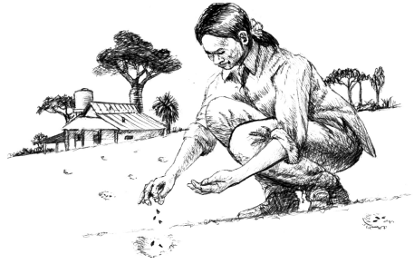
One worker plants seeds

the worker that gives water to the plants is not important. The important one is God. He makes the plants grow. Well, that picture story about a garden is a picture of you mob. God is making you grow like he makes those plants grow. And Apollos and me, we work in God's team, just like those workers in that garden. I started telling you about Jesus, and Apollos taught you more about him. We both want you to have life, but we can't give you new life. God is the one that gives you new life. We are just his workers, and you know, God will pay each of us for our work.* 9 We are like 2 men that work for God in his garden, and you are like God's garden.