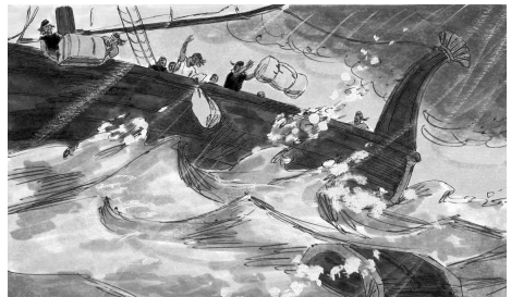
The ship-men threw all the heavy boxes and bags into the sea