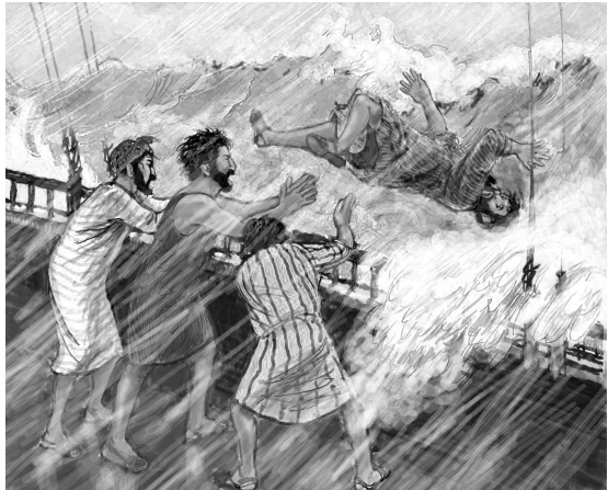
The ship-men threw Jonah into the sea

16 Then the ship-men knew that Jonah’s God is powerful, and they showed him lots of respect. They killed an animal to give to Jonah’s God, and they made promises to him.