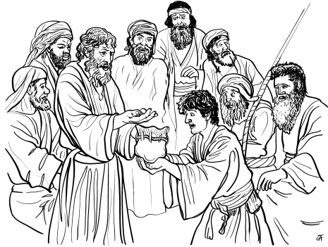
The sailors pulled out Jonah's stone, so they knew that the storm was Jonah's fault

11 The sea was getting more and more rough. So the ship-men asked Jonah, "How can we stop this storm and