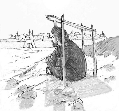
Jonah waited to see what will happen to Nineveh

want to die, I don't want to live and watch you be good to the Nineveh people.”*