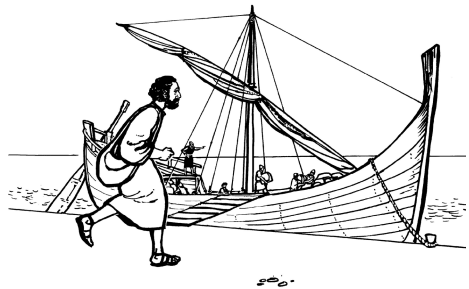
Jonah ran away from God and got on a ship

3 But Jonah didn't listen to God. Instead, he ran away from God. He went down to the town called Joppa. He wanted to get on a ship there, and go to the town called Tarshish. Tarshish is a long way away from Nineveh.