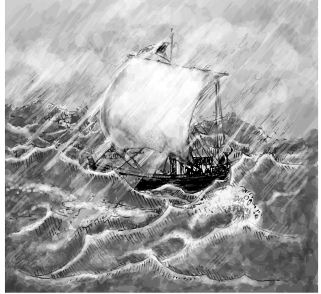
There was a big storm and the ship-men were frightened

6 Jonah was still asleep down inside the ship, so the ship's boss went to Jonah and said, "Why are you sleeping? Get up and pray